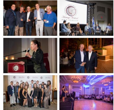
2018 HERITAGE WEEKEND & CLASSIC