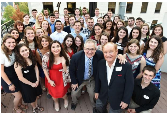
2015 HERITAGE GREECE PROGRAM