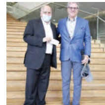
NHS CULINARY LEGACY FUND AT UNLV