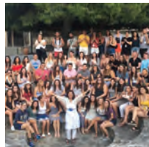
MY GREEK TABLE