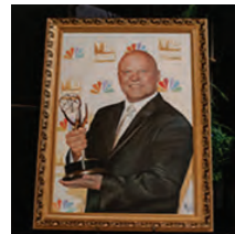
THE NATIONAL HELLENIC MUSEUM